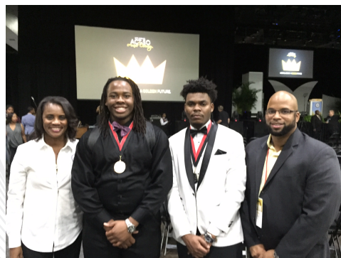
Arlington NAACP 2016 ACT-SO Branch President, students, and ACT-SO Chair after the awards ceremony