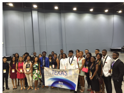
The state of Texas, prepares to enter the Awards Ceremony at National ACT-SO Competition 2016 in Cincinnati.